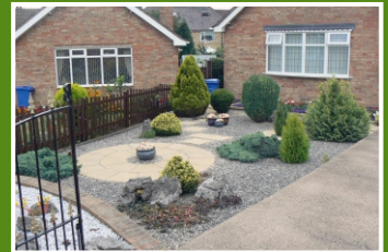
2nd Prize: 4 Torchill Close