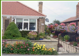
1st Prize: 6 Voases Lane