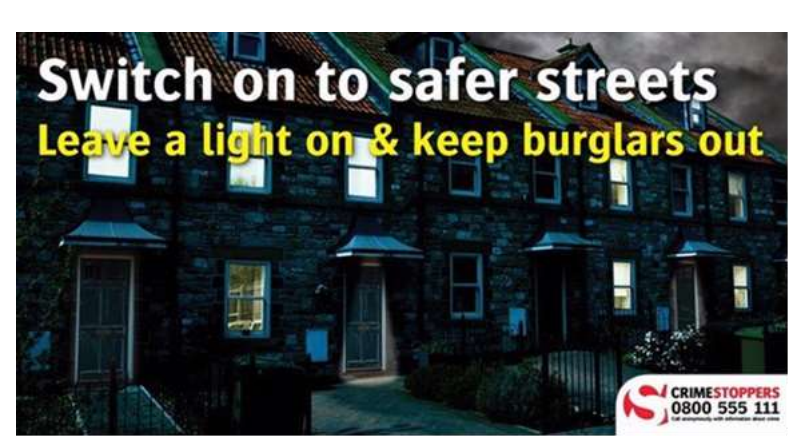
Is anybody home?